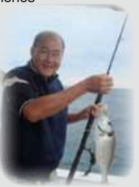
Deep Sea Fishing