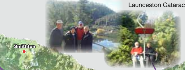
Launceston Cataract Gorge