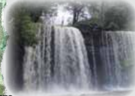
Mount Field National Park