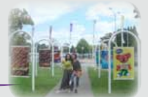
Cadbury Chocolate Factory