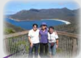
Freycinet National Park